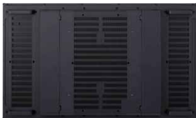
The GXD-L52X1 conforms to VESA standard mount (400mm x 400mm).